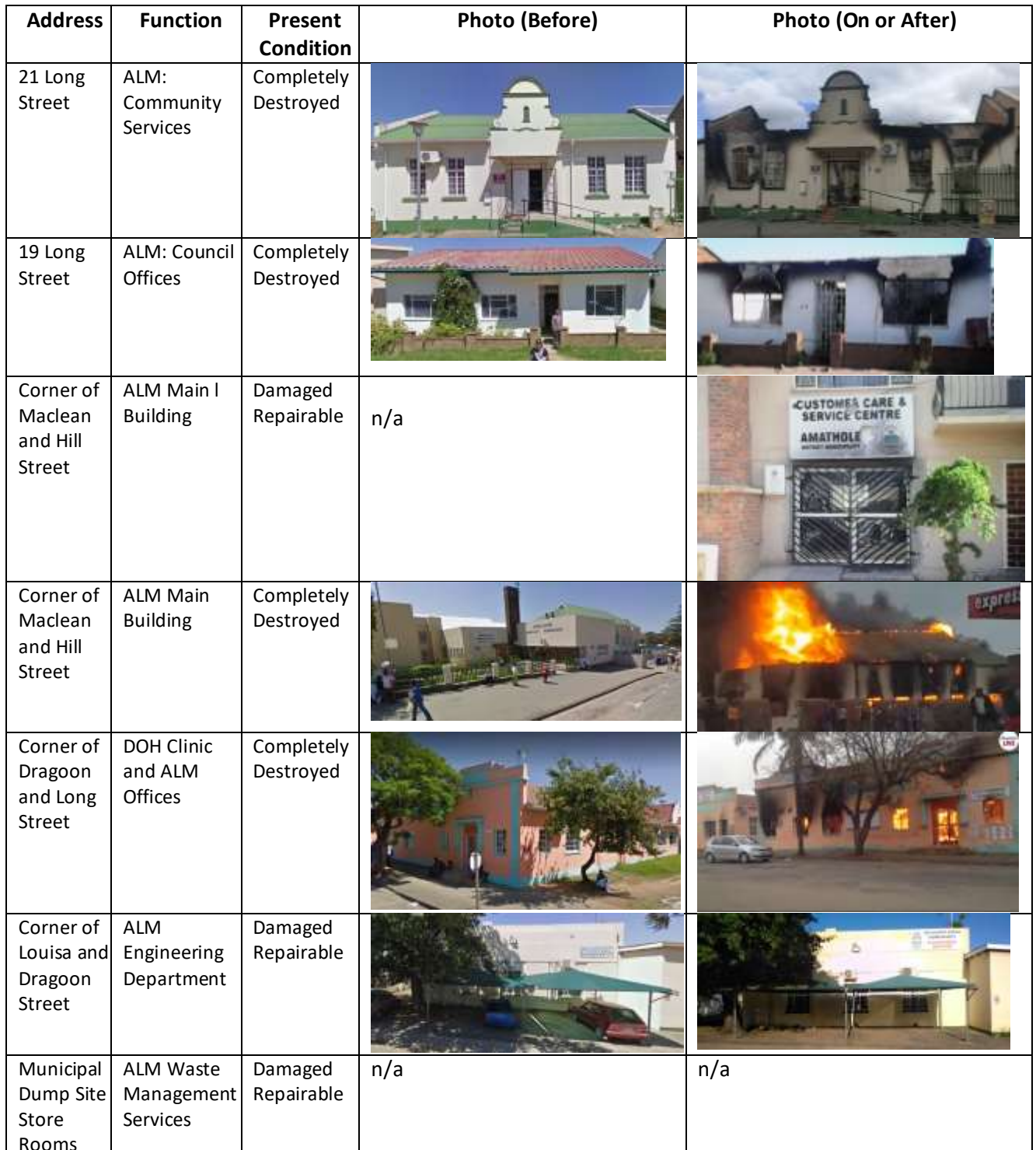
Table 1: Buildings Affected: